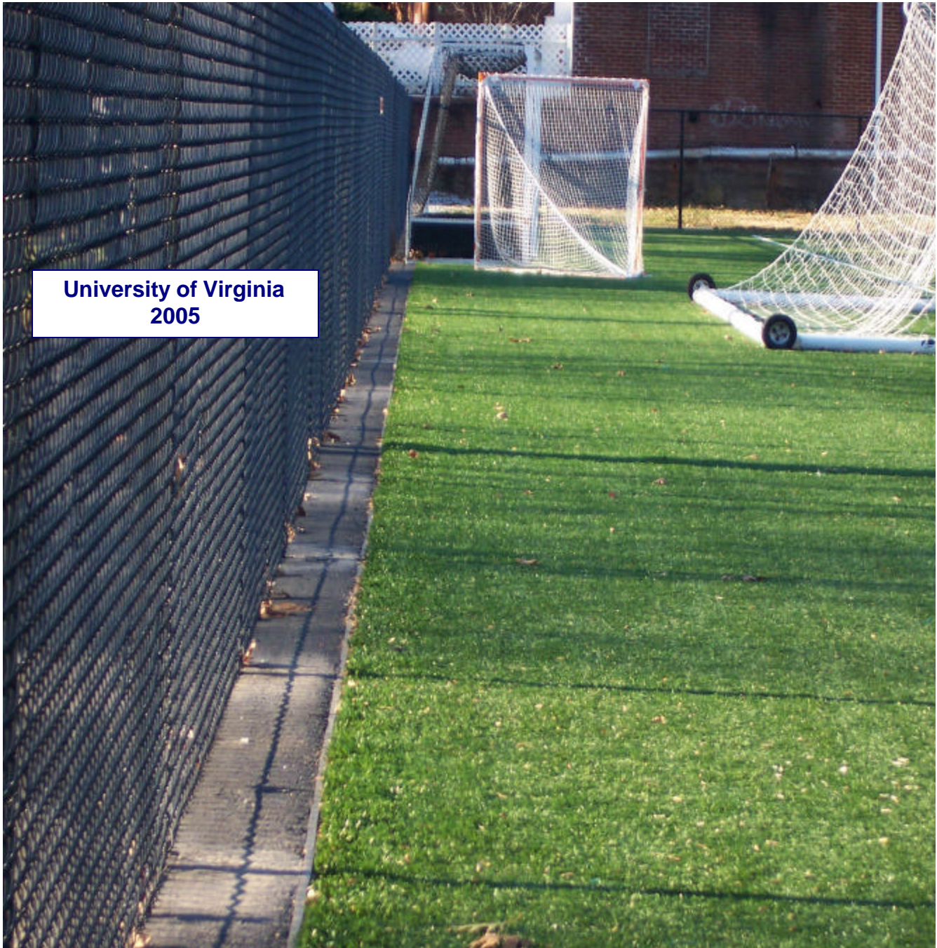
Turf Anchor Bordering a Stand Alone Infill Turf Field- Asphalt to Infill Turf