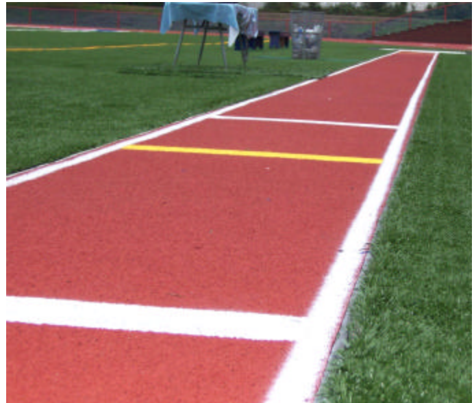
Completed Installation Bordering the Long Jump Runway