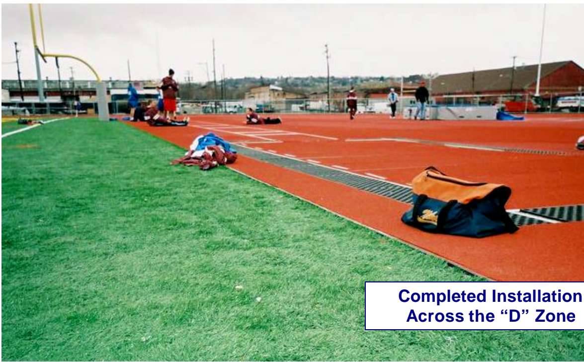
Completed Installation Across the "D" Zone